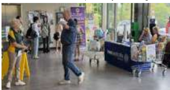
Inter District N5 support N4 for their first Food Drive and Membership Promotion in Leura