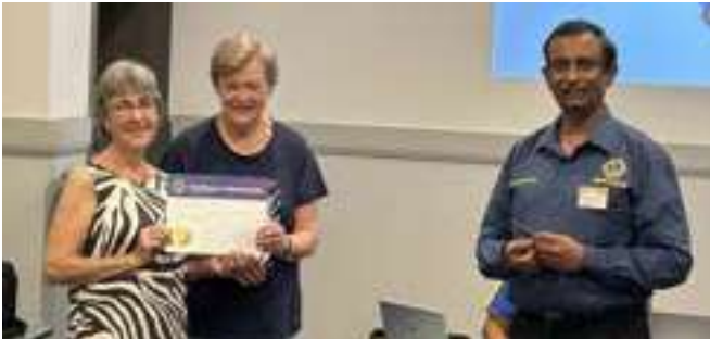
Welcome to Kings Langley