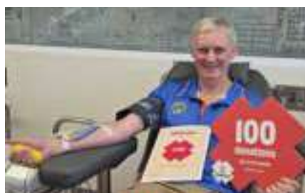
Bringing up my ton as part of Toongabbie Seven Hills Lions Club Blood Donation Project.