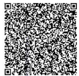
Room with Breakfast

If you wish to book accommodation outside of the default dates in the Group Link, please contact the Holiday Inn reservations team direct via email: reservations.hiaucklandairport@ihg.com Just a reminder to advise them that you are attending the Lions ANZI Pacific Forum and wish to access the Group Rates LC2/LC3.